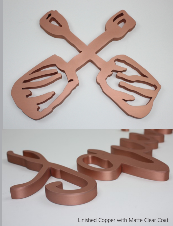
Linished Copper with Matte Clear Coat