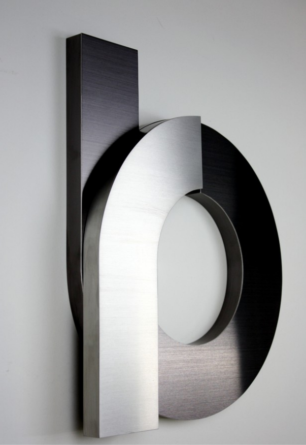
Linished Stainless Steel combined with Linished Black Titanium