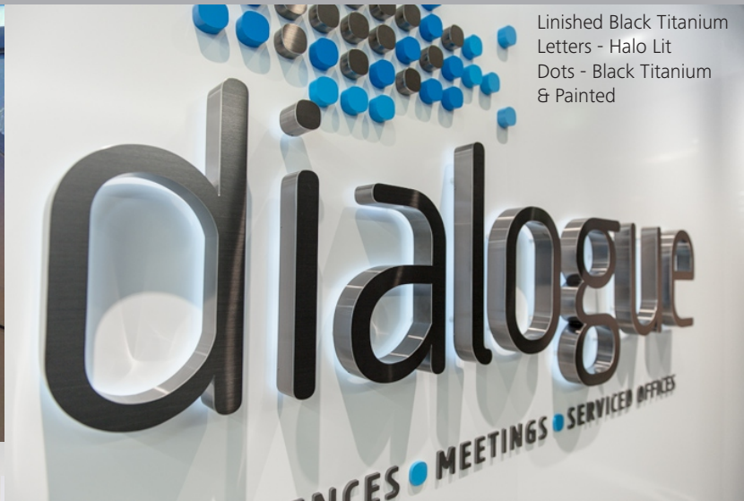
Linished Black Titanium Letters - Halo Lit Dots - Black Titanium & Painted