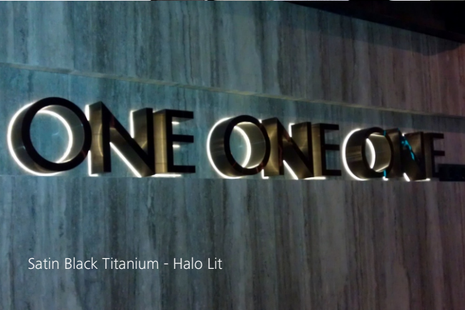
Satin Black Titanium - Halo Lit