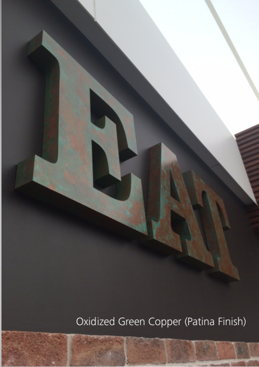
Oxidized Green Copper (Patina Finish)