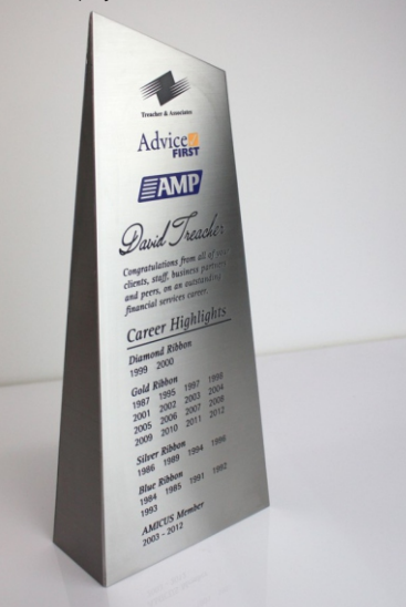
Back - Linished & Polished Stainless Steel