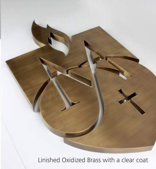
Linished Oxidized Brass with a clear coat