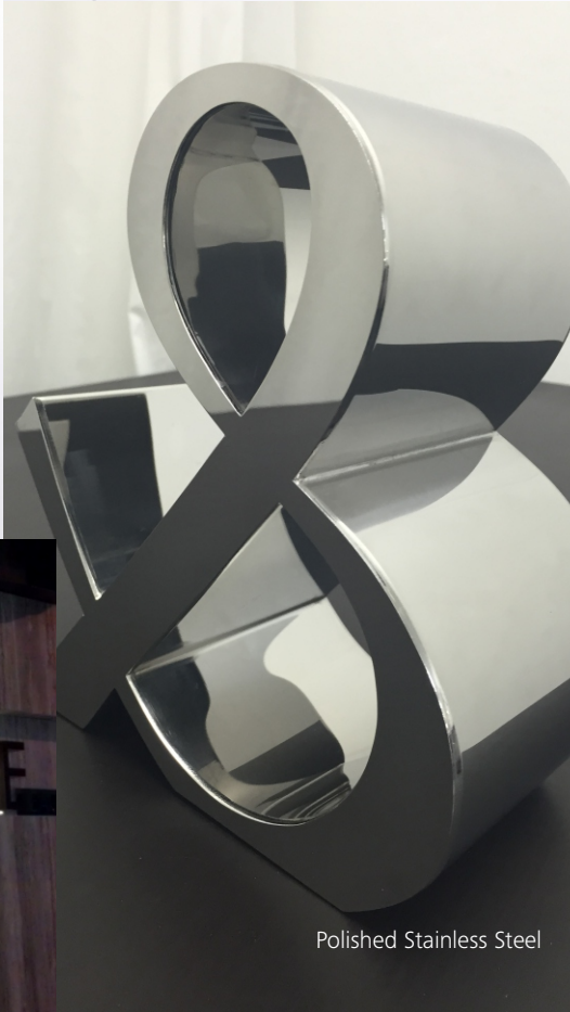
Polished Stainless Steel