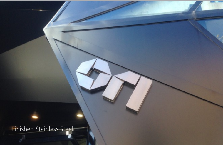
Linished Stainless Steel